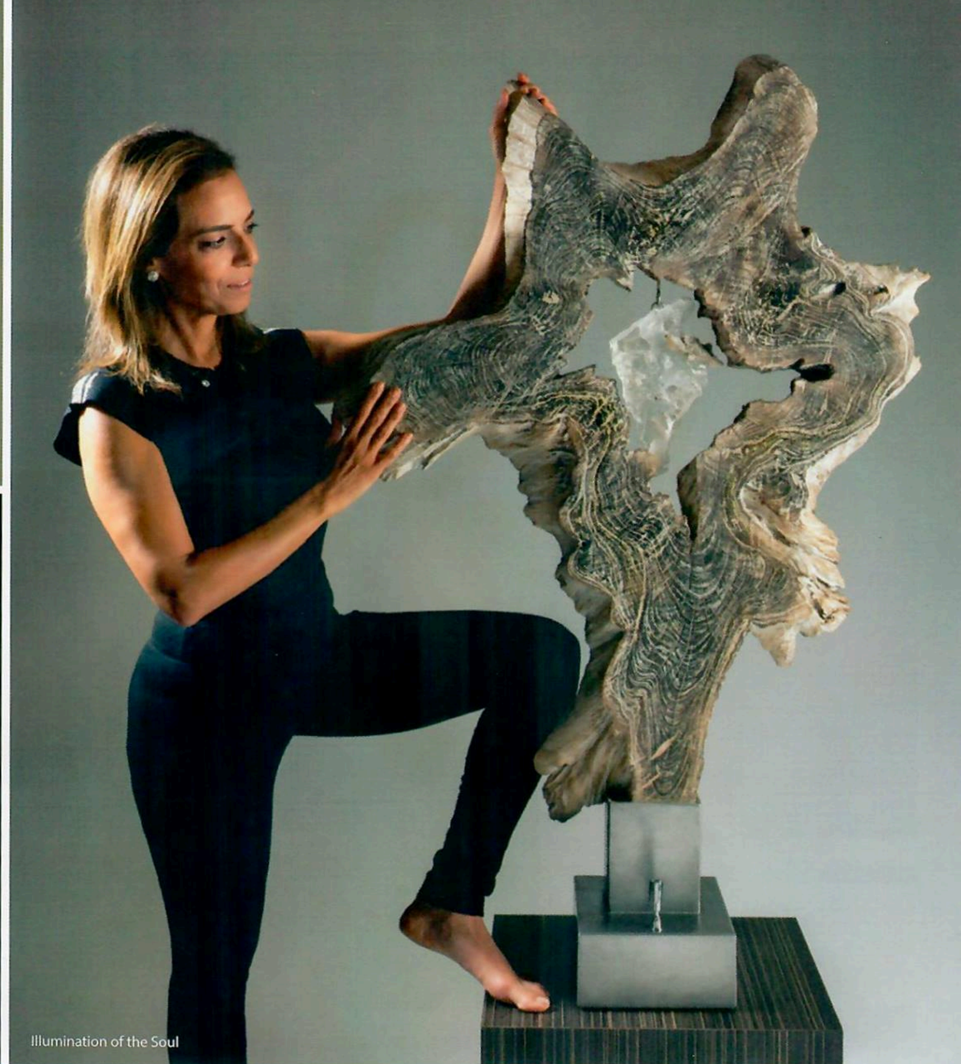
Illumination of the Soul