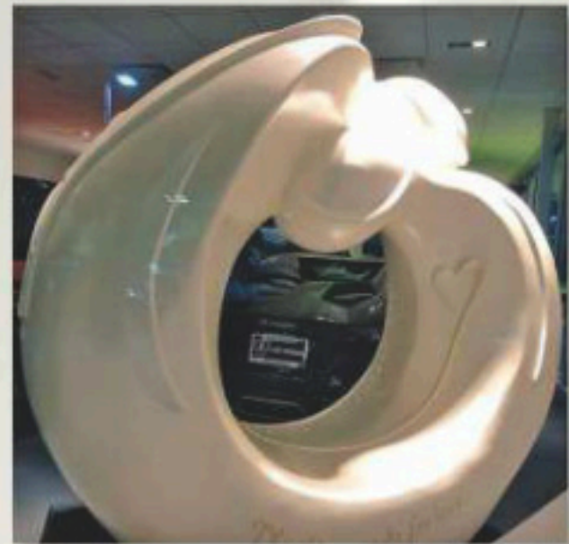
Keeping fast company at Lamborghini Las Vegas.

Special thanks to everyone who hosted my St. Jude sculpture and shared it with your world: Lamborghini Las Vegas, Audi of Henderson, Underground Revolution, William Carr Gallery and Siena Italian Authentic Trattoria.